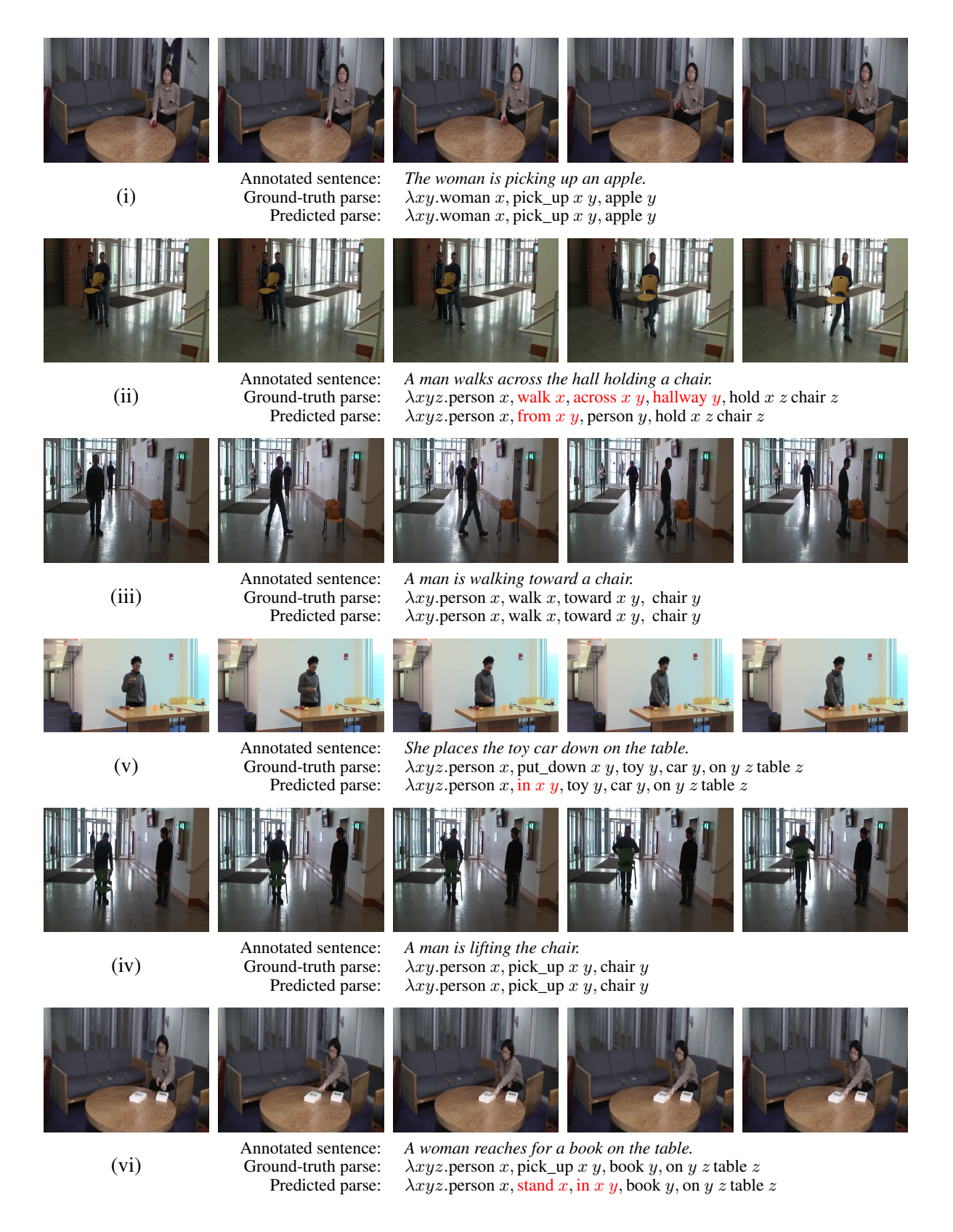
Figure 5: Six examples of frames from videos in the dataset along with target and predicted logical forms showing both successes and failures. Failures are highlighted in red. Note how incorrect parses are usually similar to the correct semantic forms. The intended meaning is often preserved even in these cases.