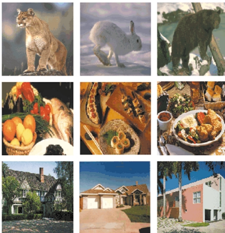
Fig. 1. Examples from three of the nine categories of visual stimuli used by Kreiman and colleagues 4 . Top row, animals; middle row, food; bottom row, spatial layout (scenes).

Kreiman and colleagues 4 found that 18% of hippocampal, 16% of entorhinal and 9% of amygdala neurons responded selectively to one or, more rarely, to two of the visual categories. For example, some neurons fired more in response to pictures of animals than to stimuli in any other category. However, no particular animal elicited more firing than any other animal. Other neurons fired more in response to both photographs and drawings of famous faces but not to any other categories; again, there were no differences in responses to different face stimuli. Thus, these neurons